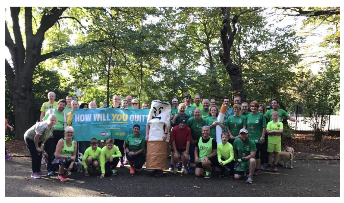
ALBERT PARK RUN -23/9/17

Monoxide (CO) levels measured and were provided with brief advice on stopping smoking at these events. Smoking remains the single preventable cause of ill-health and premature deaths in Middlesbrough and Public health is committed to ensuring support is available for anyone wanting to quit for good.