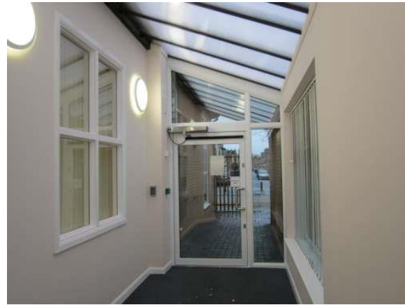
Refurbished main entrance