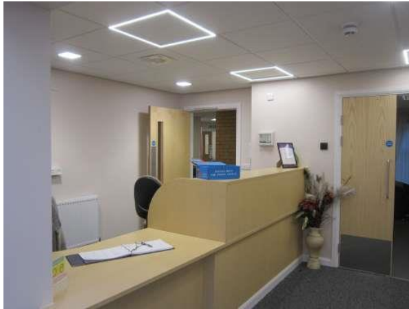
Redesigned accessible reception area